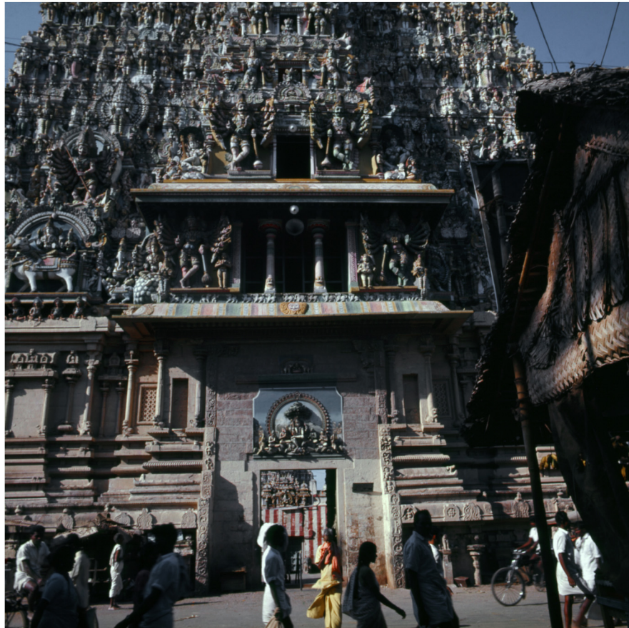
Top right: A supplicant in front of a temple at Narendra Sarovara, a man-made pond in Puri, Odisha. Above: Devotees outside a temple in Varanasi. Right: The Meenakshi Temple in Madurai, Tamil Nadu. Facing page: Images from Bellini's 1985 visit to India for the 'Golden Eye' project. "Our task was not only to visit India, but [to take note of] furnishings, objects, fabrics, clothes and architectural components that increase the value of the extraordinary, imaginative and educated capacity of Indian artisans, their skills and their knowledge in using their hands."